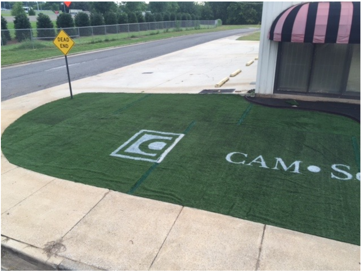
First layer of infill applied, wrinkles are smoothing.