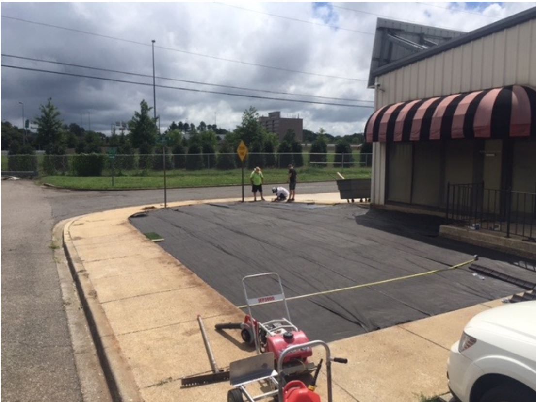
Install weed barrier.