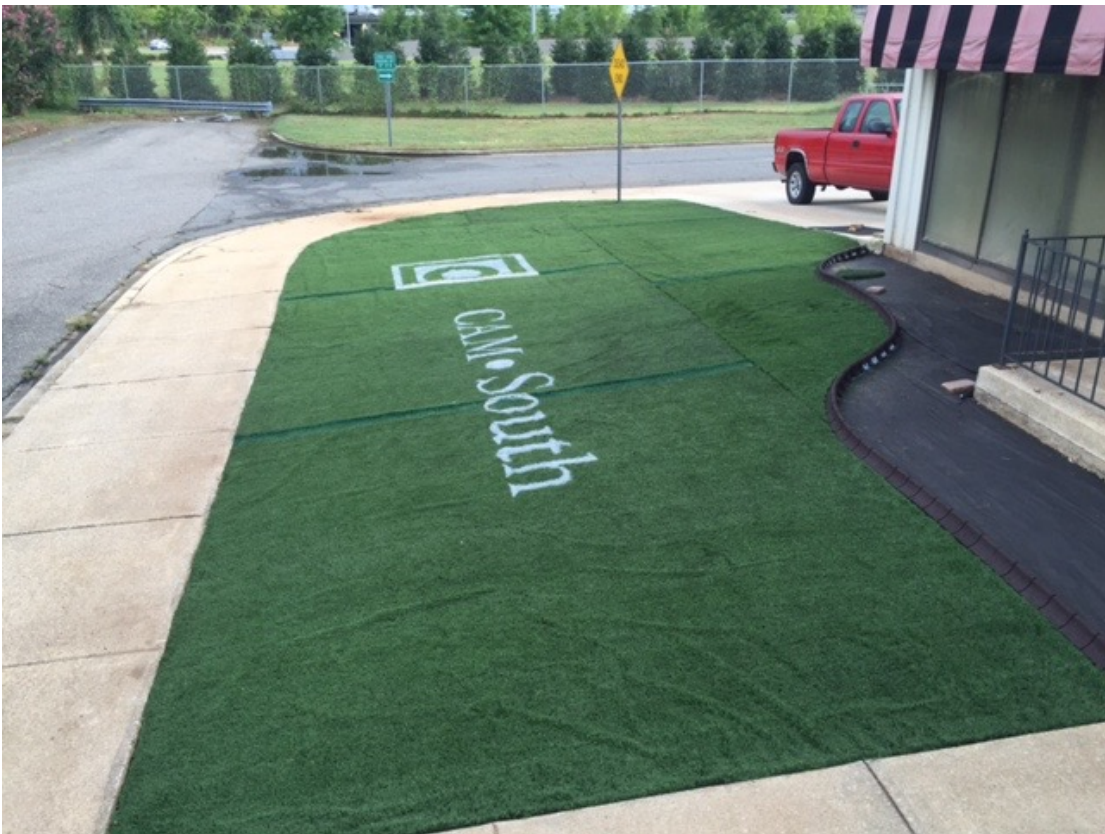
Recycled rubber tire landscape edging.