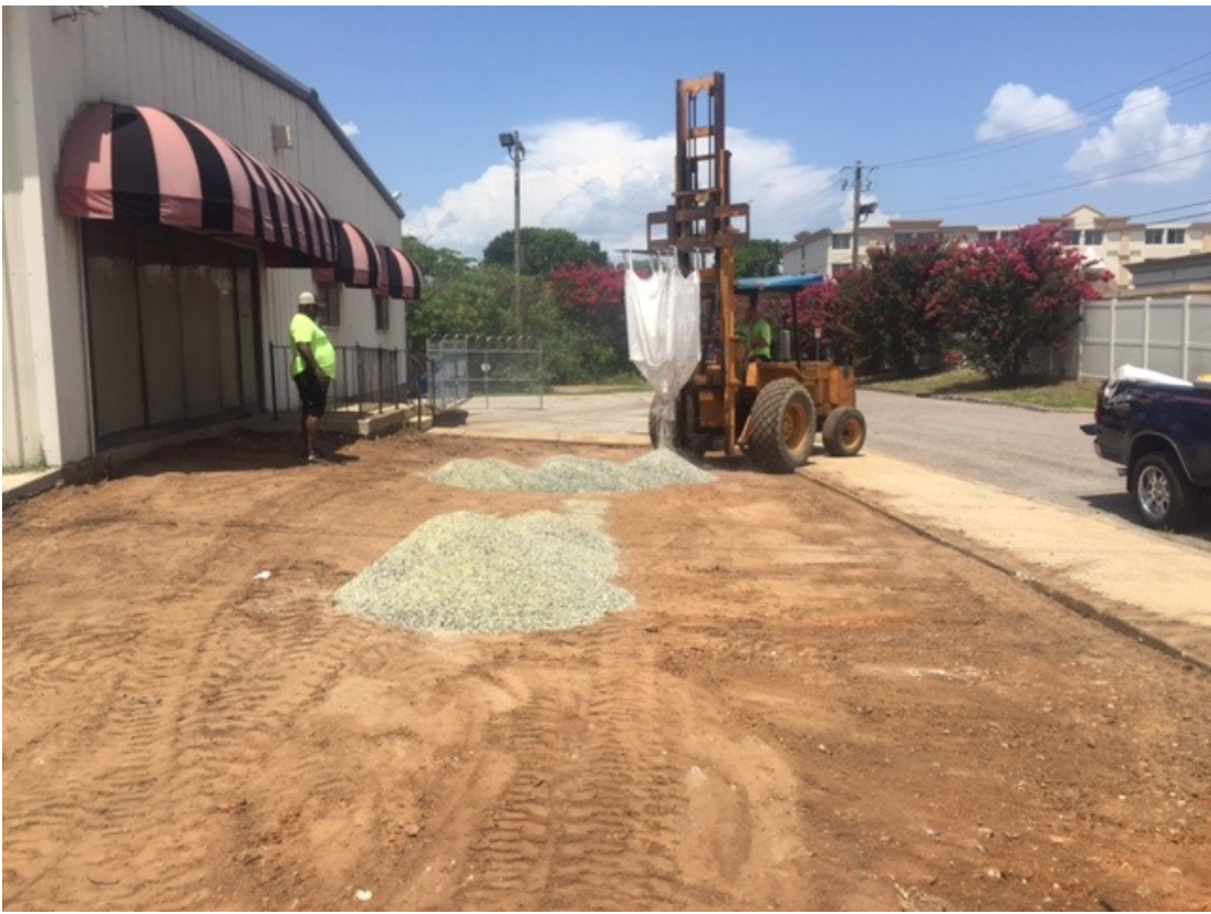
1 ton Super Sacks, 7 total