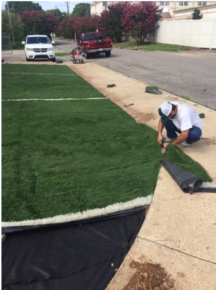
Trim the edges with a razor knife.