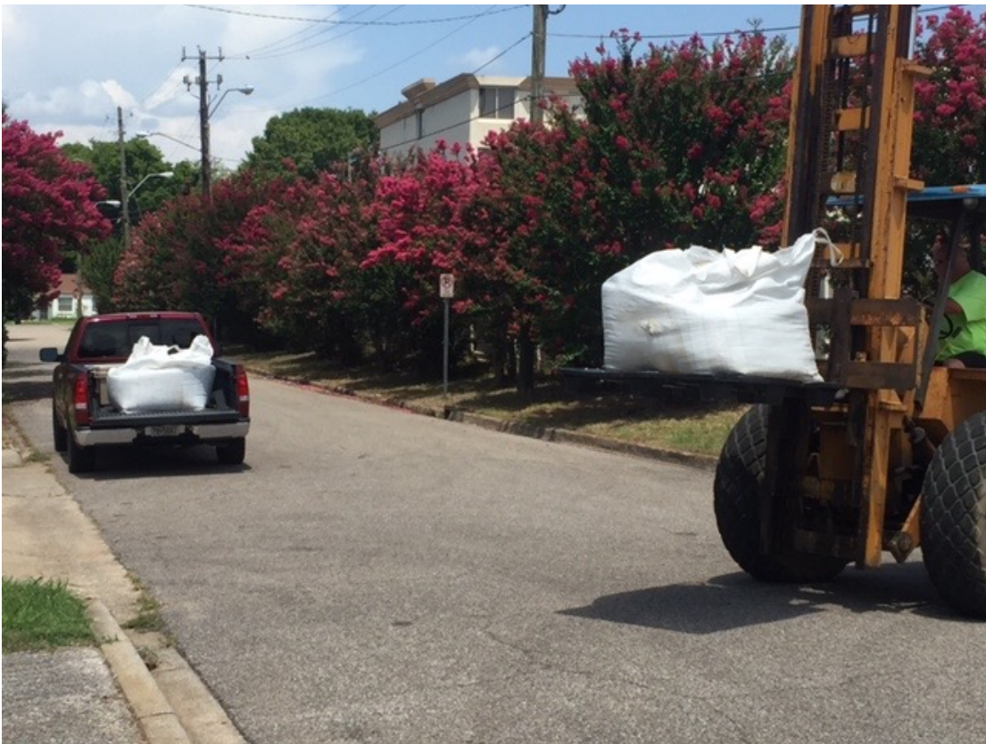
Delivering recycled crushed glass.