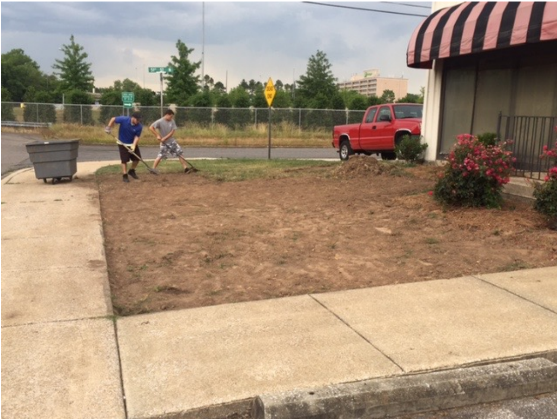
Remove existing sod (2)