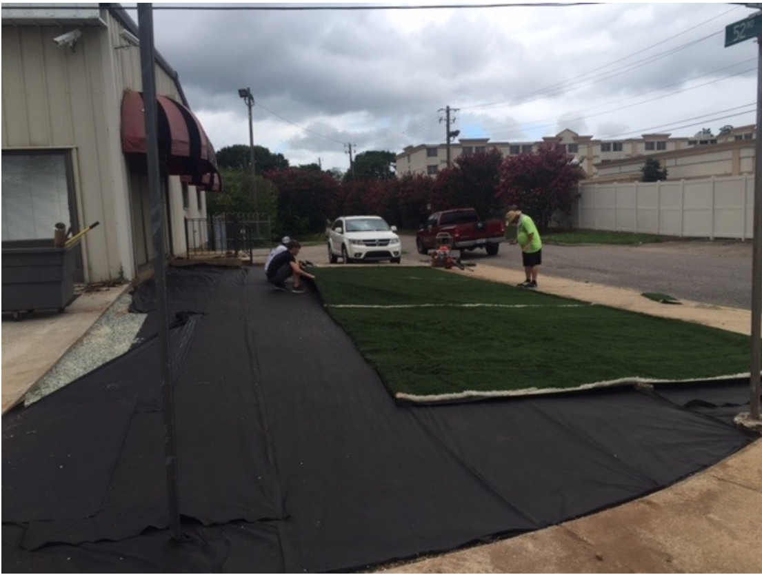
First piece of turf being placed, 15' x 45'.