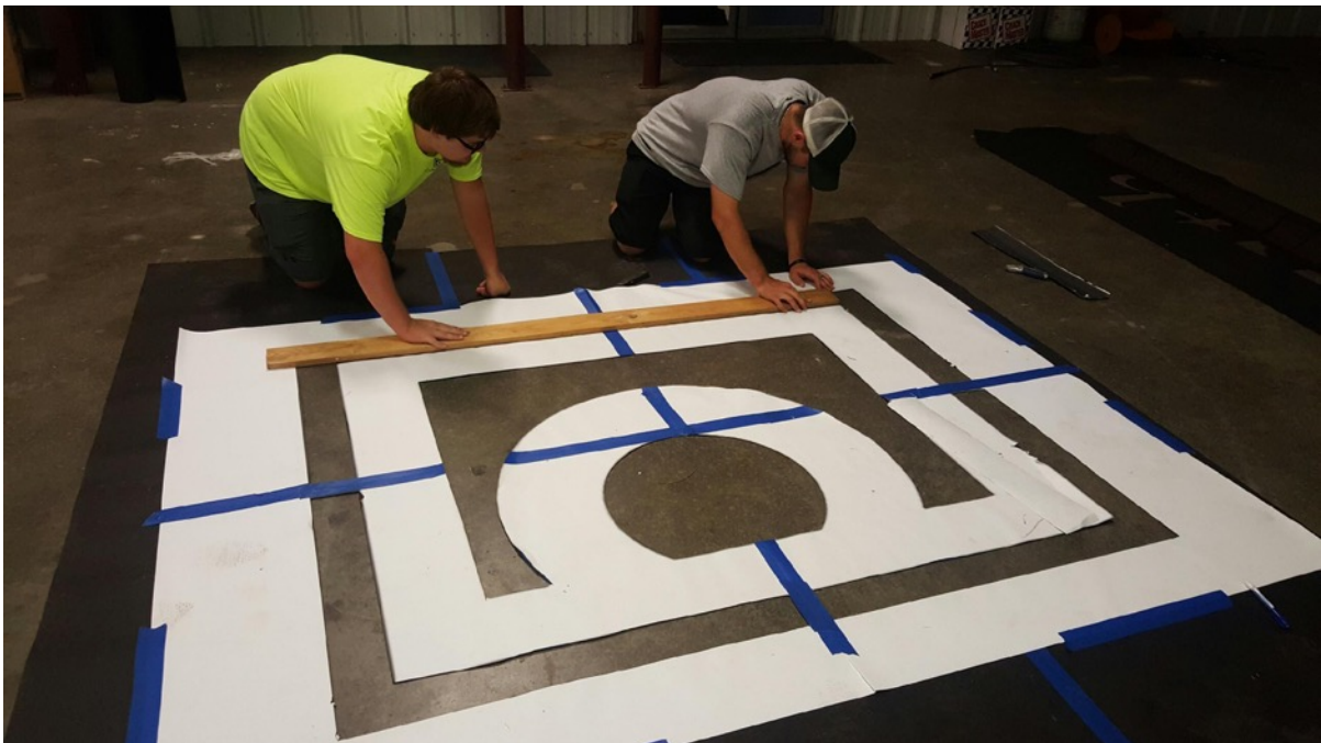
The finishing touch for our stencil.