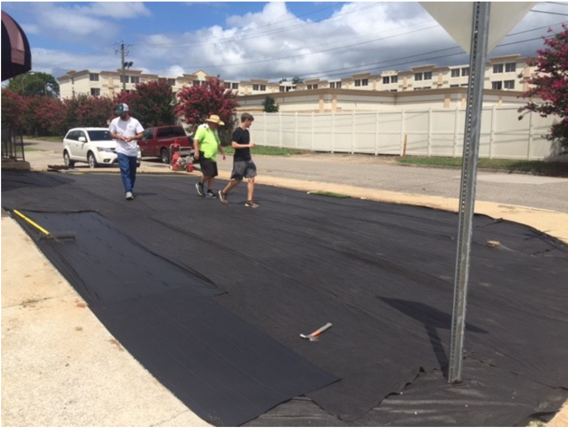
Level the aggregate and compact.