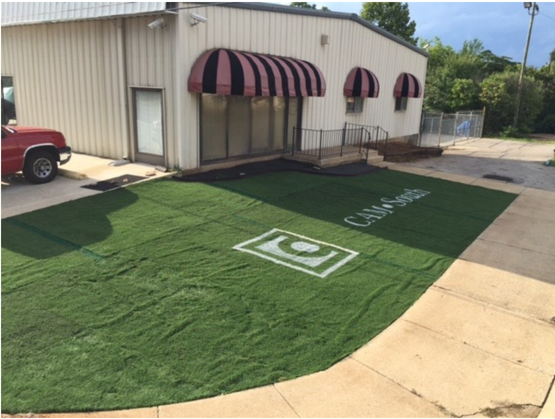
Ready for the rubber infill.