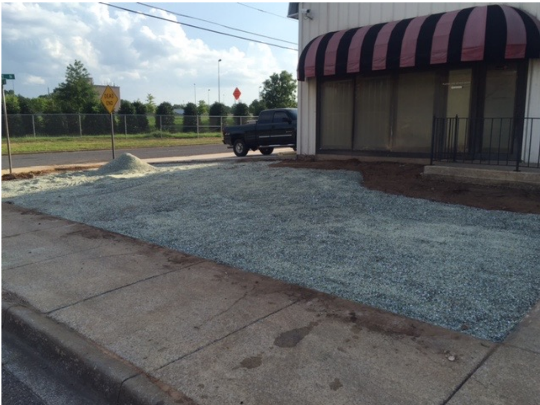
Recycled crushed glass as our base layer aggregate.