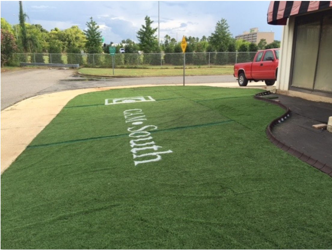
Second piece of turf and landscape edging.